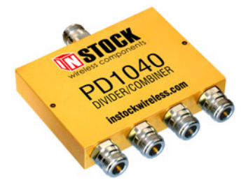
4-Way, N-Jack Connectors