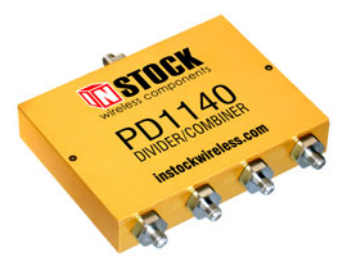
4-Way, SMA-Jack Connectors