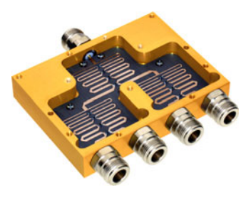
precision microstrip circuit